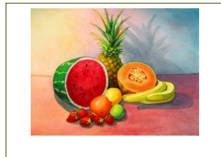
Make sure you eat a Healthy lunch! :)

The fee for university applications is $120.00 which gives you an option of 3 program choices. A maximum of 3 program choices can be at one institution and each additional program choice costs $40.00. Each university sets its own fees for application to their institution. Deadline for applications is January 13, 2012 for Fall 2012 term. Students may still apply after these dates but should be aware their program preference may be filled.